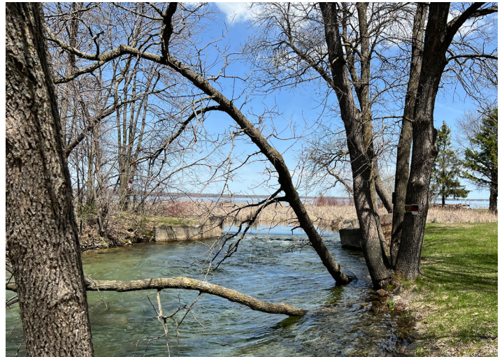
May 10, 2022