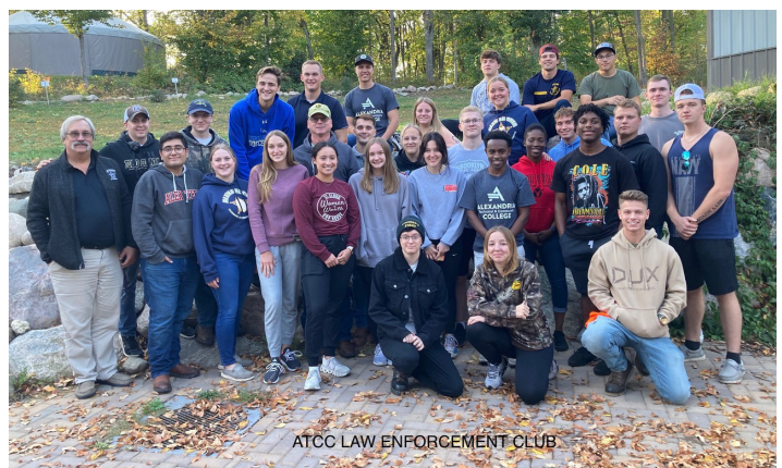
ATCC LAW ENFORCEMENT CLUB

Assistance of any sort is gratefully appreciated. Contributions are documented and qualify as tax deductible per IRS code, Section 170. Individuals who are interested in how they can help are encouraged to contact us at 15567 Smokey Timbers RD NW, Miltona, MN 56354 or smokeytimbers@gmail.com . Additional info is available at smokeytimbers.org .