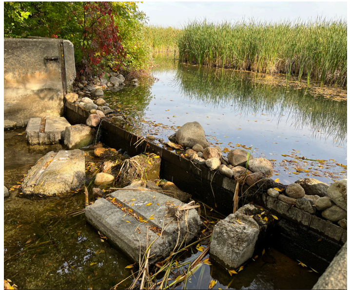
September 21, 2023