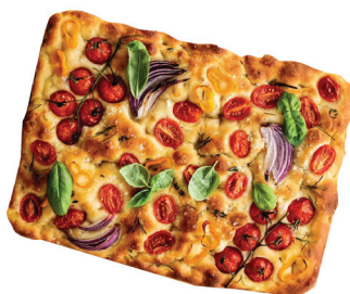
Wednesday, August 13, 6pm Focaccia for Beginners