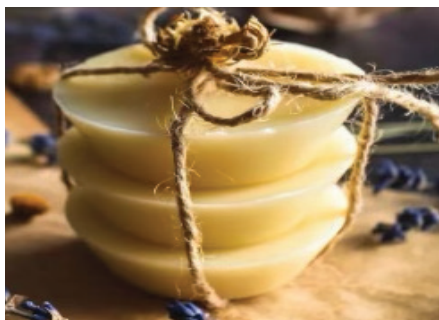
Wednesday, July 9, 6pm Your Home Apothecary