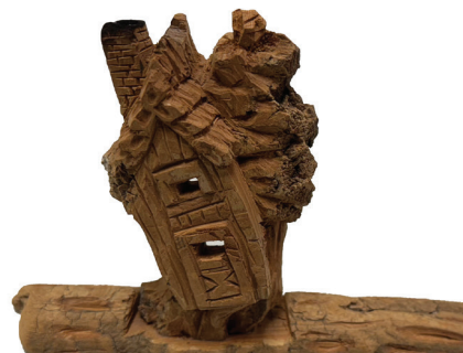
Wednesday, July 16, 1pm Bark Carving (Woodcarving)