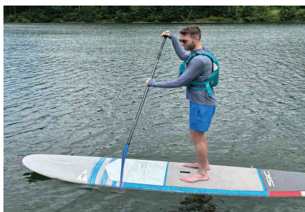
Wednesday, July 23, 9am Paddle Tour!