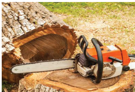
Wednesday, June 25, 6pm Cut Down a Tree Safely