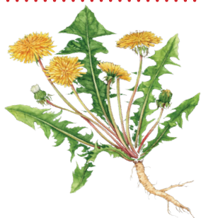
Wednesday, July 16, 6pm Foraging for Medicinal Plants