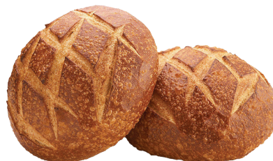
Wednesday, June 18, 6pm Sourdough for Beginners