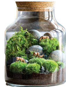
Wednesday, June 18, 1pm Building a Terrarium