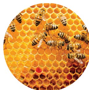
Wednesday, July 23, 6pm Beekeeping for Beginners