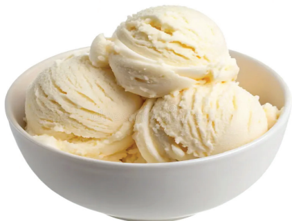
Wednesday, June 18, 6-7:30pm Ice Cream Science