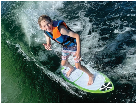
Wednesday, June 11, 9am-11am Lake Surfing Kids Kamp