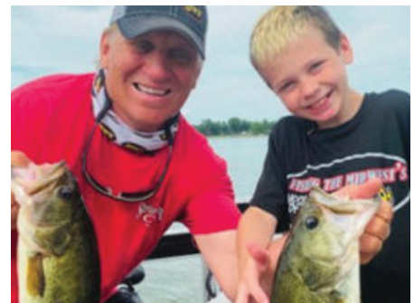
Wednesday, June 25, 1pm ZEBCO School of Fish

www.smokeytimbers.org | 15567 Smokey Timbers Road NW