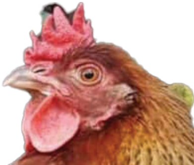
Wednesday, June 11, 6pm Backyard Chickens 101