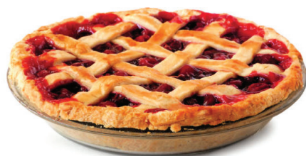
Wednesday, August 6, 6pm Pies! Pies! Pies!